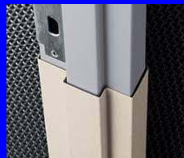
Door Frame Protection