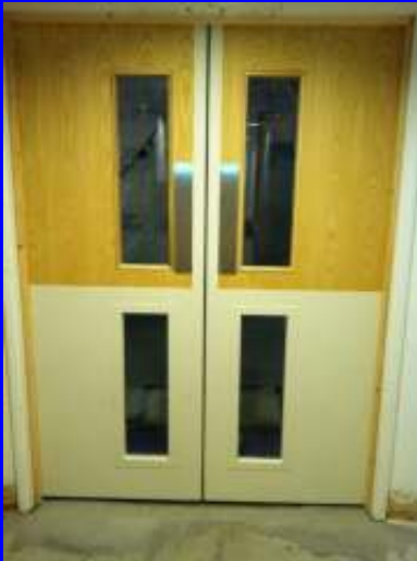
Guardian Bois Veneer range with gloss or satin finish. Available in all veneers including Maple, Beech, American Oak and Ash.

If you require further details or information please do not hesitate in contacting us.