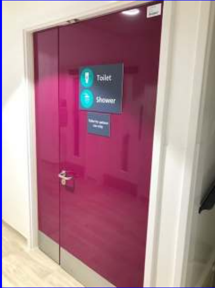
Vibrant Colour Range

Guardian Hygienic Doors manufactured to suit clients specification, giving quality products with a ten year warranty