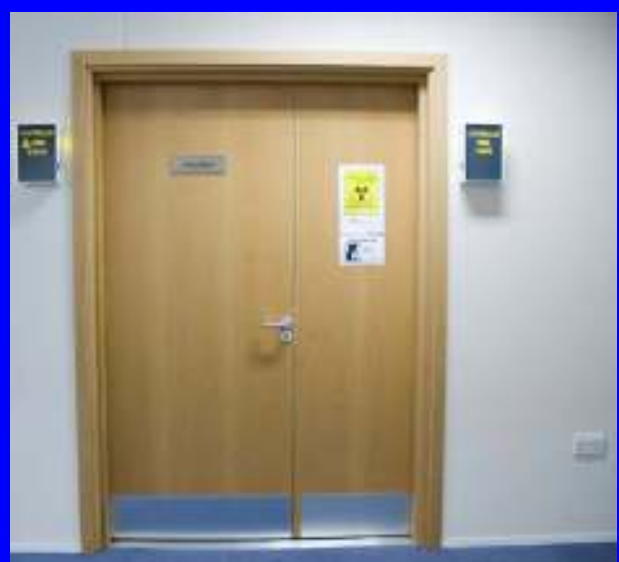
Guardian Lead Lined door sets See separate brochure for full details