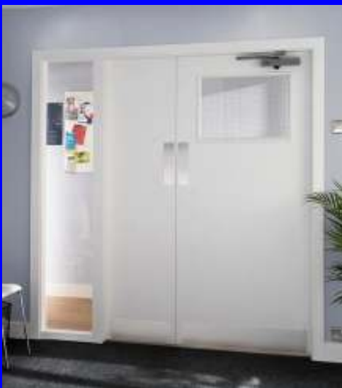
Hygienic Guardian Doors for all applications