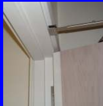
Encapsulated door frames