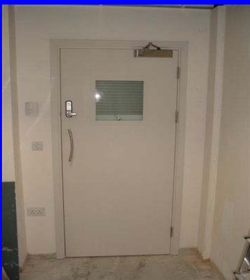
Guardian Hygienic door sets. Encapsulated with smooth hygienic sheet from the Satina or Spectrum range.